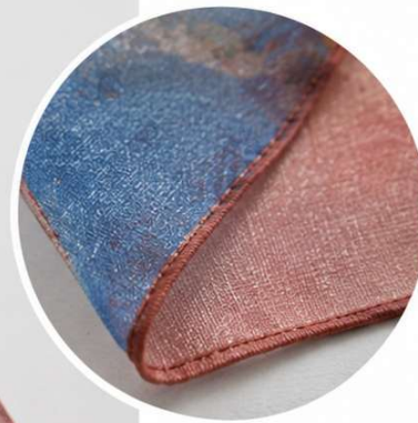
Close-up of the hand rolled edge