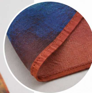
Close-up of the machine hem (baby hem)