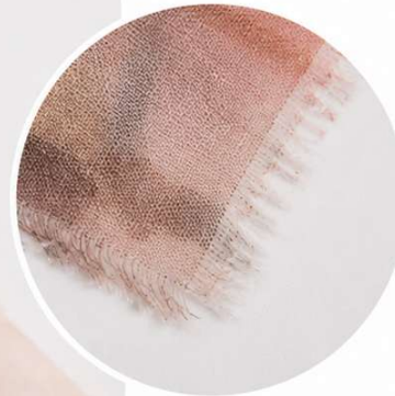
Close-up of frayed / open edge